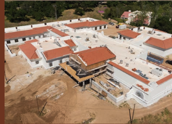
Construction on the new 75 bed Continuing Care Center continues to move forward.

When completed the ultra-modern facility will be a jewel in the community, providing long- and short-term skilled nursing care, as well as physical and occupational services.