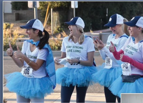
A spirited team of runners at the 2018 October Classic.

In addition to its strong financial support of the Capital Campaign, the community contributed more than $102,600 in response to the Foundations' semi-annual mail appeals. The October Classic run/walk/wellness fair added $13,000 to our bottom line last year and featured a "Paws for a Cause" pet walk.